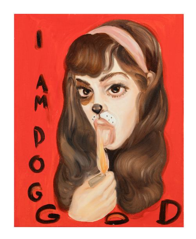
"Megan" oil on canvas, 2020

Palillo's dreamy style and futuristic perspective of life often blur the lines between fiction and reality.