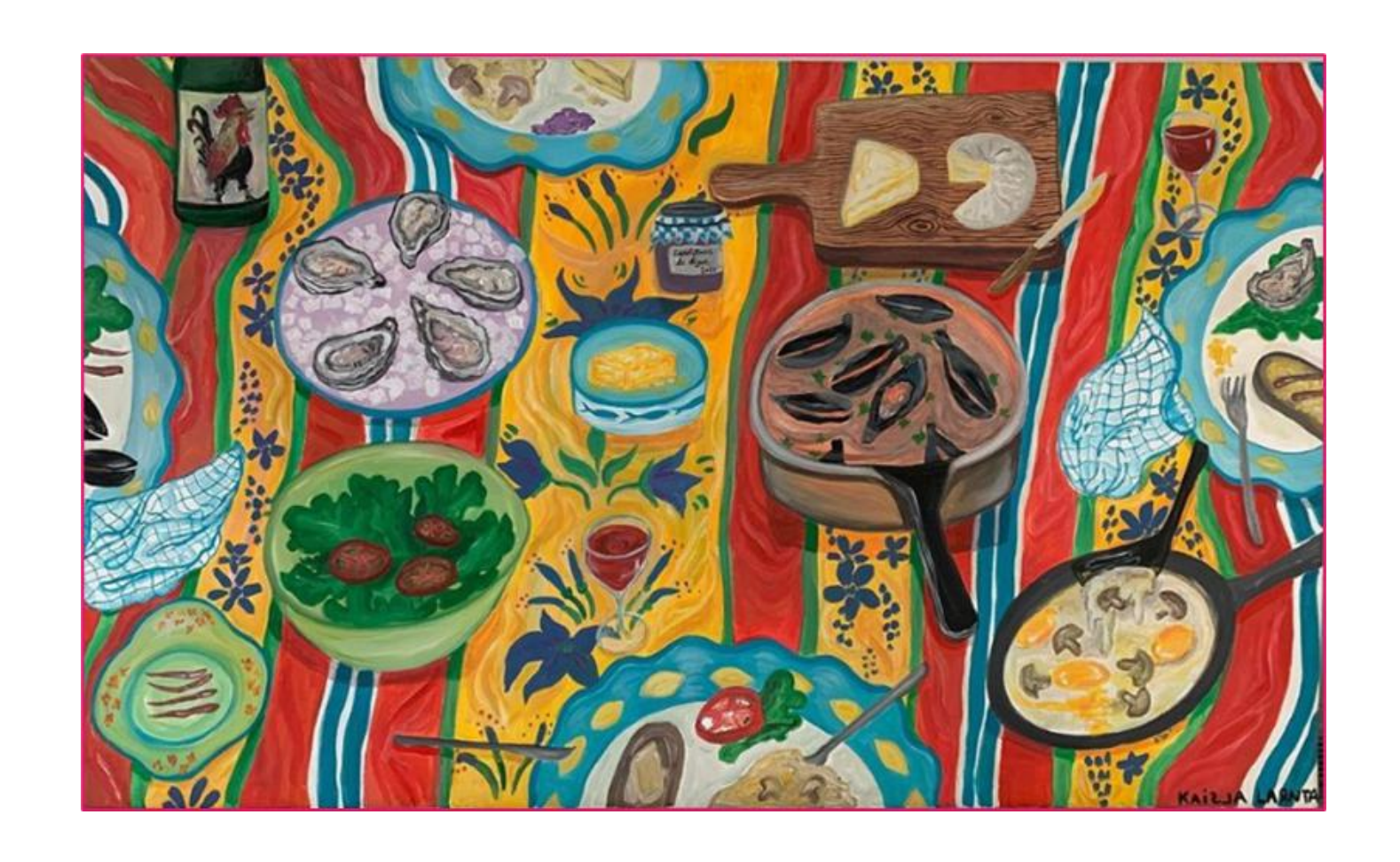
"Dîner avec la famille (dans le sud de la France)", oil on canvas, 2022